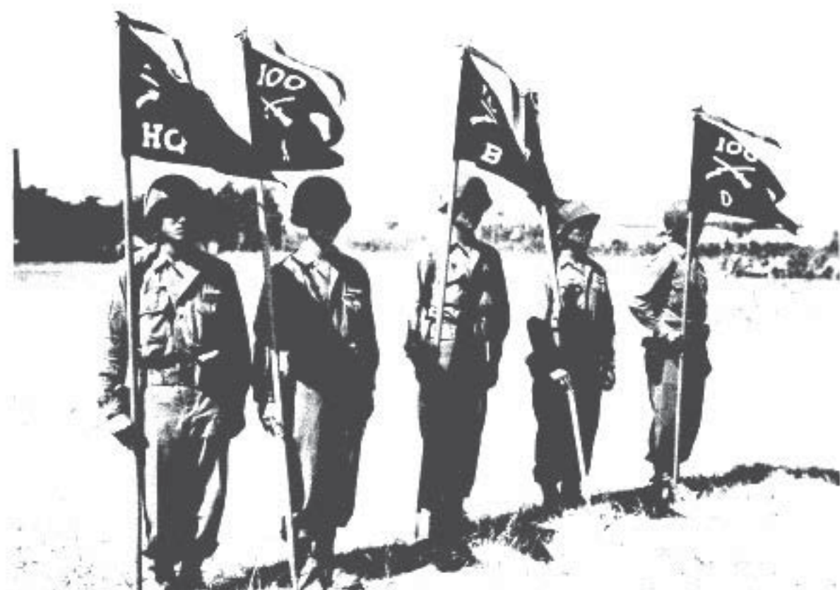
Battle Streamers, awarded by a Presidential Unit Citation, wave above Standards of the 100th, July, 1944