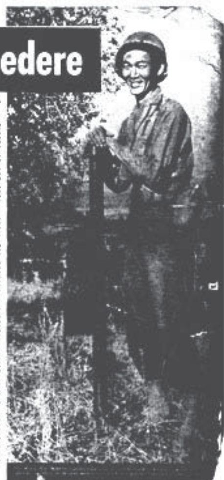
Slim and his bazooka

The battle of Belvedere was fought on January 1, 1945, in the mountains of Italy. It was the last battle fought by the 100th Infantry Battalion, a unit of Japanese-American soldiers who had been interned in the United States during the war. The battle was a tactical success for the Japanese, but it was a moral failure. The Japanese soldiers who fought in the battle of Belvedere were fighting for a cause that was as noble as any that has ever been fought. They were fighting for the freedom of their fellow Japanese-Americans who had been interned in the United States during the war.