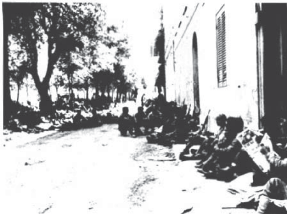
Resting in Leghorn