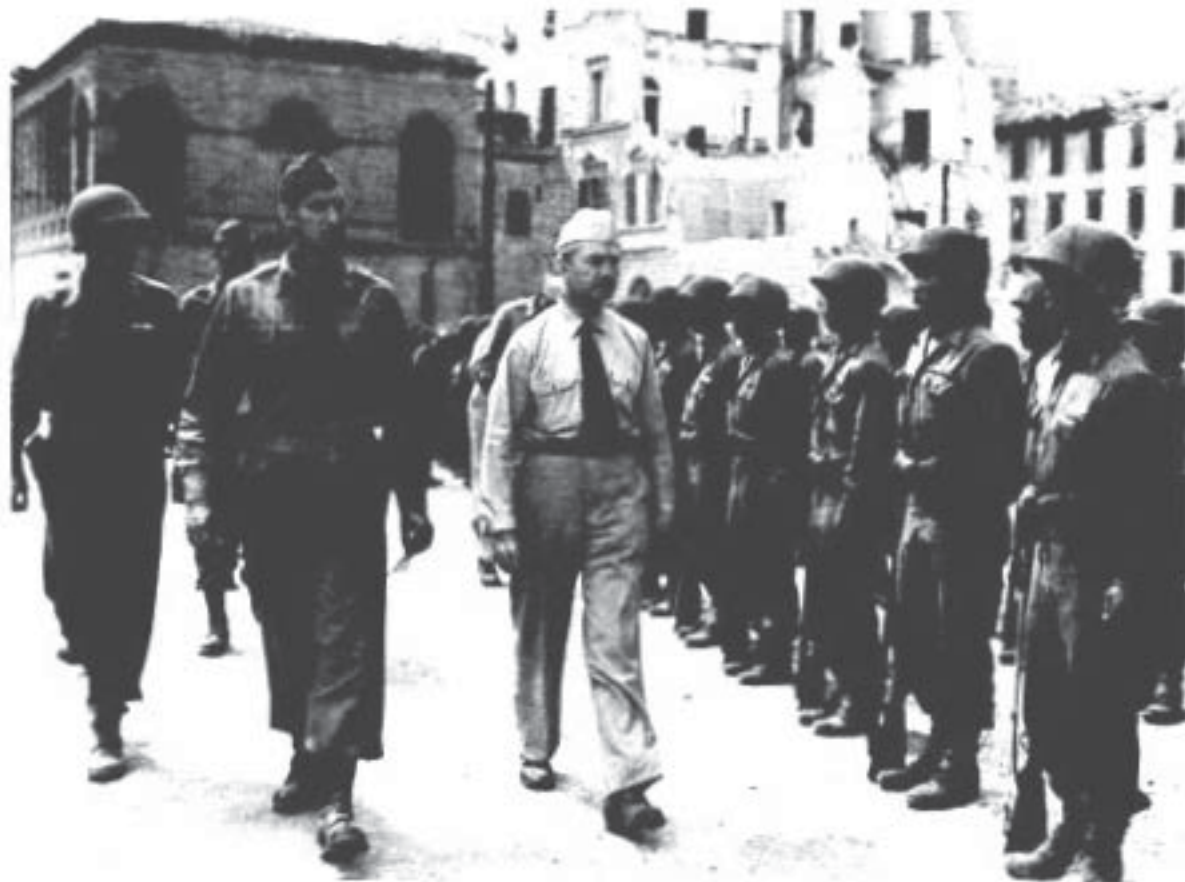
General Mark Clark & Secretary of the Navy James Forrestal inspect the 100th, August, 1944