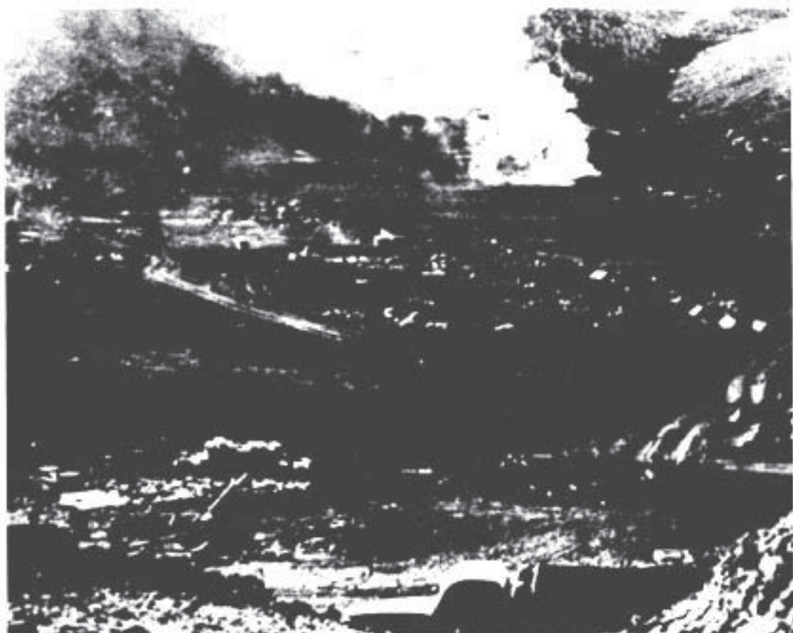
Artillery battle near Elia