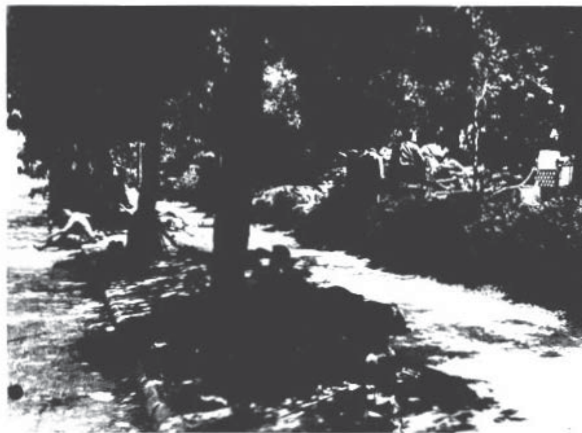
Resting & Peeing in Leghorn